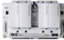
Ovation system DCS card Westinghouse system control module