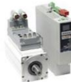
ControlLogix 1756 controller