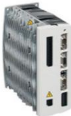
ControlLogix 1756 controller