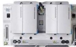
Ovation system DCS card Westinghouse system control module